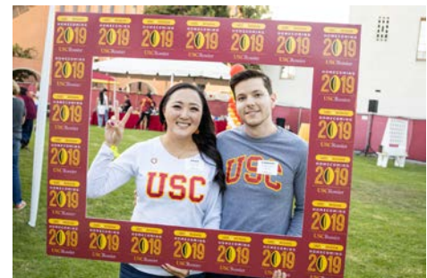
2019 Homecoming Picnic