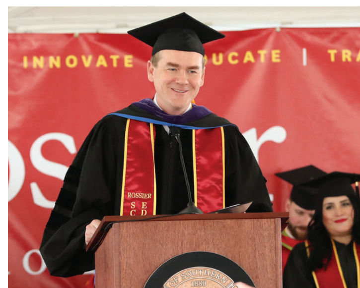
Michael Bennet United States Senator for Colorado "Fixing a system that has been broken for decades can prove frustrating in a culture hungry for instant results. Many give up. Others blame broader forces affecting student learning, like healthcare and housing, and lower expectations for what schools can do. All of you — as future educators, administrators, experts — will wade into this. I'm sorry to break it to you, but it won't be easy. Because your job is not to keep things the same, for that is no better than accepting cruel outcomes for our kids. Your job is to make change, to transform schools, to lead the debate. And that means revolutionizing the craft of teaching by trying new methods and questioning how things are done."