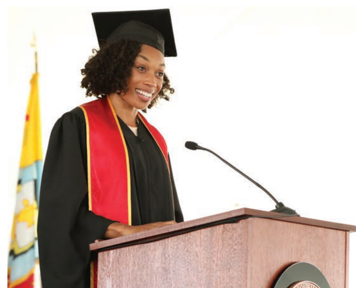
Allyson Felix USC Rossier Bachelor of Science in Elementary Education '08 "The time I spent walking this campus on my way to becoming a graduate of the Rossier School of Education was a time I will never forget. Some of my favorite college memories were walking into 32nd Street School and looking those young students in their eyes and seeing their excitement around learning. I know that I received much more than I gave — those young students helped to teach me life lessons that I hold on to. Rossier and USC taught me discipline. They taught me how to pursue my passion whole-heartedly. They taught me that your career is not just a paycheck — it's an opportunity to make a difference in someone's life. To inspire and help them to grow — you are prepared — you have been trained well."