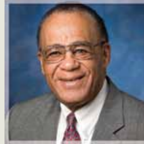
Dr. John Brooks Slaughter