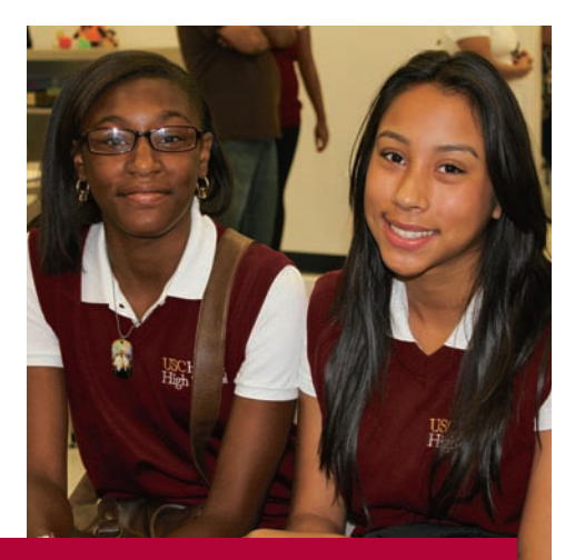
Rossier researchers are studying how Hybrid High's blended learning model meets the individual needs of its students

The study will also lay the groundwork for instrumentation that can be adopted, transformed and improved in the hundreds of blended learning experiments being launched in charter schools and regular public K-12 schools around the U.S. and internationally.